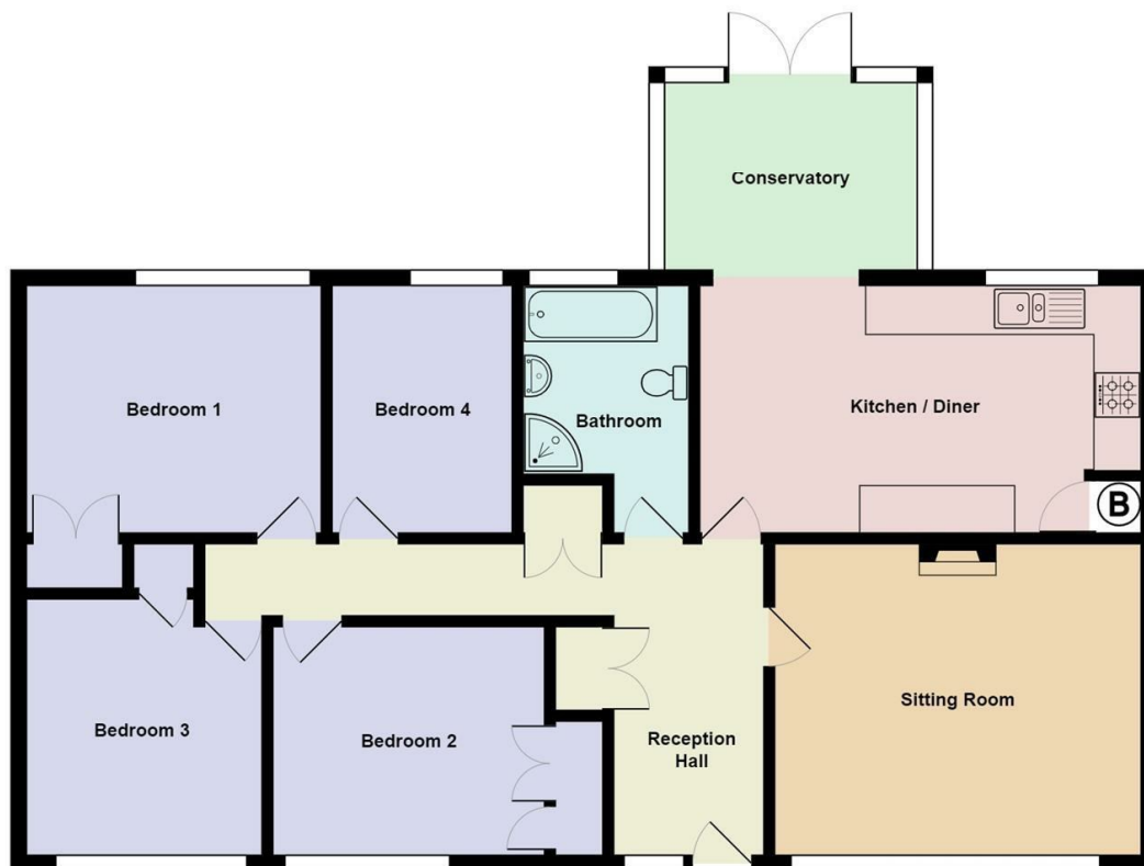
This floor plan is for layout guidance only. Whilst every care is taken in the preparation of this plan, it is not drawn to an accurate scale and all measurements, windows and openings are approximate.